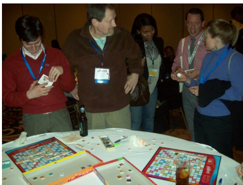
Conference attendees decorate scrabble tiles during the Welcome reception.