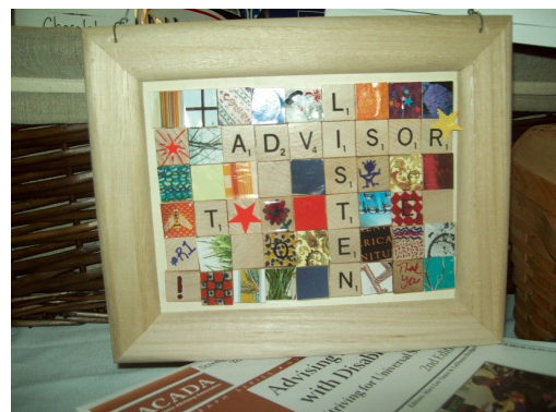
One of the many tiled collages constructed from the tiles decorated during the reception.