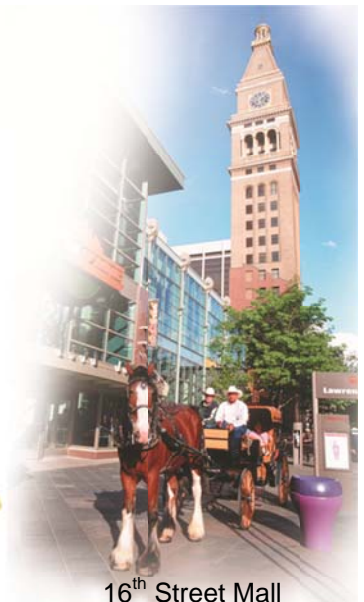
16 th Street Mall

Region 3 and Region 4 are in a friendly competition to see which region has the highest percentage of attendees staying at their host hotel based on our regions' Annual Conference attendance. The losing Region will provide a complimentary registration to their own Region meeting for a recipient from the other region.