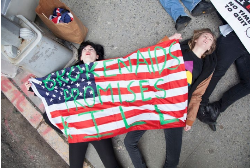
Figure 3 QUEEROCRACY members participating in a die-in action titled 'Broken Promises Kill' in April 2011 outside the United States Mission to the United States as part of a rally for funding global AIDS programs.

who sign a petition or like a photo on Facebook and consider their civic responsibilities fulfilled. To them, social networks are useful as a means of outreach and communication for organizing, but the weight, gravity, and force of bodies on the street, the volume and echo of their voices, and the potential influence that these disruptions may have are what turns them on. They want to change systemic failures through direct action, and the culture of clicktivism simply is not enough for them.