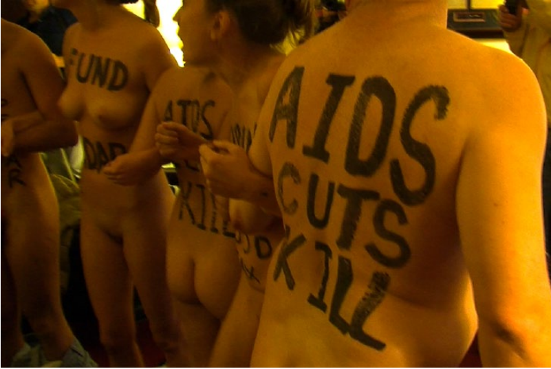
Figure 1 On 27 November 2012, members of QUEEROCRACY held a naked action inside the Washington DC office of Speaker of the House, Rep. John Boehner to expose the ‘naked truth’ about what budget cuts would mean for AIDS programs. Cuts to HIV/AIDS funding would strip people living with HIV/AIDS from essential programs and services that many need to survive and 350,000 people with AIDS will be denied live-saving treatments.

As queer young folk, Queerocracy feels responsible for promoting sexual health on positive and informed terms rather than on ignorance. While the focus of most HIV/AIDS activism has shifted to providing access to drugs and treatment in developing countries, attention to criminalization in the United States, they believe, is key to tackling legally supported forms of discrimination. These activists consider HIV/AIDS criminalization to be one of the most pressing social issues of their time. They belong to a time that has not known sex separate from the risk of infection, yet they profoundly acknowledge a generation of people who experienced HIV as a continual matter of life and death. Now that death is not as prevalent, Queerocracy is shifting the conversation of HIV/AIDS as it relates to the criminal justice system and the silence over HIV as a pressing issue within the mainstream LGBTI movement.